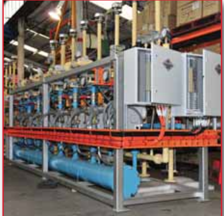
Gas Rig for Multiple Premix Burner System

Retrofit Burner System for Melting Furnace